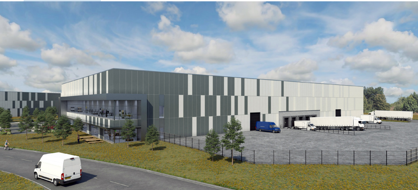
Indicative rendering of Unit 1