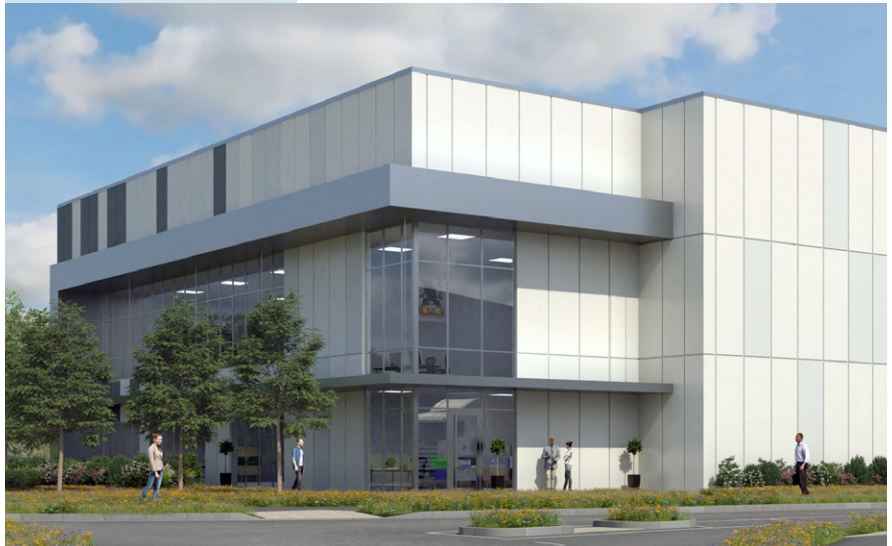
Indicative rendering of Unit 2

The development is under construction and scheduled for practical completion in Q4 2022.