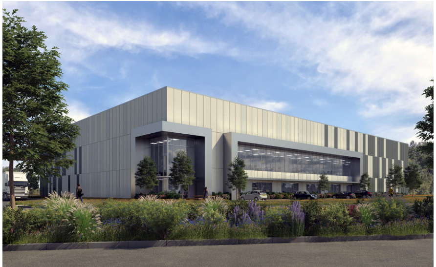
Indicative rendering of Unit 3